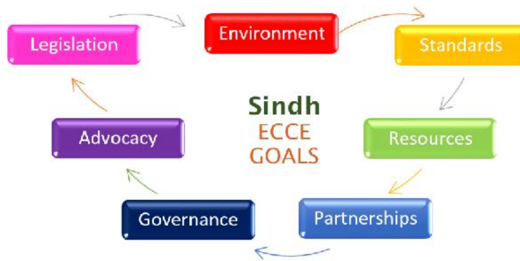
FIGURE 2 SINDH ECCE POLICY GOALS 2015